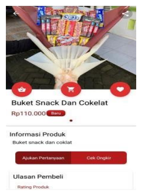
Figure 6. Product display

• Product display, description, and price of the bouquet.