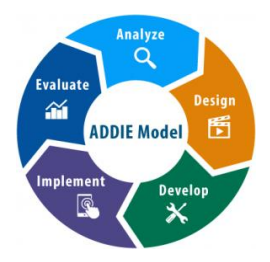
Figure 1. ADDIEStage

The ADDIE model is one of the instruction designs models that are often the basis for other instructional design models. In general, the ADDIE model (Rosset, 1987) consists of the Analysis, Design, Development, Implementation, and Evaluation phases [5]. The ADDIE stages are as follows.