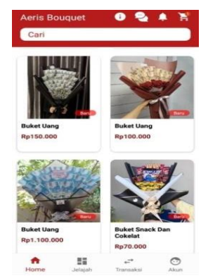
Figure 5. Display "Home"

The following is the design of the Aeris Shop application taken from the customer's point of view using the Aeris Shop application, starting from the Home, Browse, Transactions, Accounts, Products, Product Description,